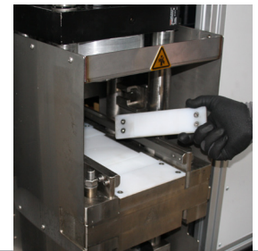
Press Piston Guide