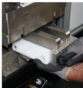
Ejection Piston Spacer