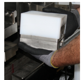
Press with Eject Piston Assembly