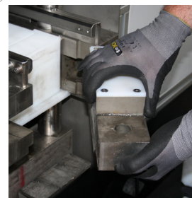
Press Head Front Block