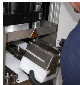
Press Piston Assembly